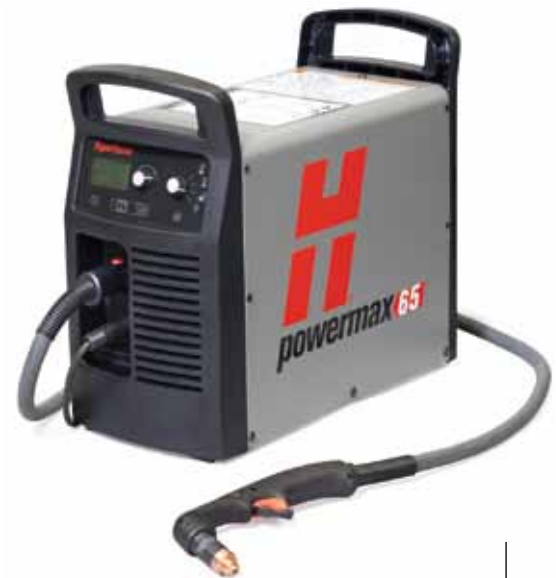
Duramax torch styles