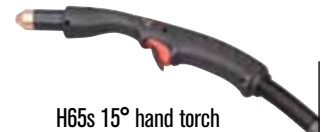
H65s 15° hand torch