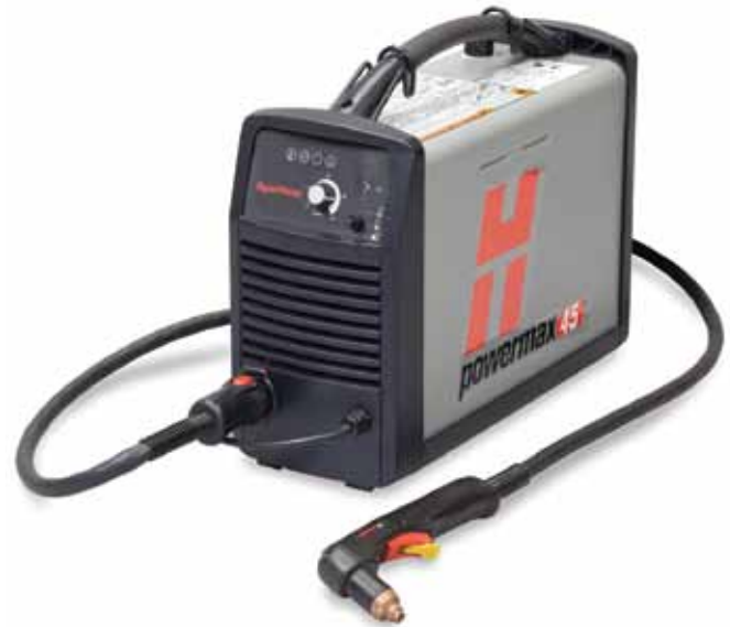
T45v hand torch