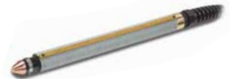
T45m machine torch